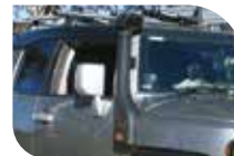
FJ CRUISER - 011SAT0185A

Note: (TD) - Turbo diesel models only (D) - Naturally aspirated diesel models only (P) - Petrol models only