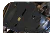
Prado 120 Series & FJ Cruiser Front Underbody Guard & Transmission Guard

*For illustration purposes only. TJM Underbody Guards are supplied electro coated black. Colour coding is an optional extra that can be sourced through your local TJM 4WD distributor.