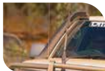
100 SERIES - 011SAT0180R

Proudly Australian made and quality assured, you can have the confidence that a TJM Airtec Snorkel will achieve peak performance each and every time.