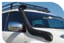
120 SERIES (TD) - 011SAT0188I 120 SERIES (P) - 011SAT0288I