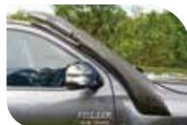
HILUX 15+ - 011SAT0187D HILUX 15+ - 011SATW187D* *(WEDGETAIL AIR RAM SHOWN)