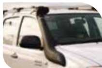
HILUX 05-15 - 011SAT0187Z