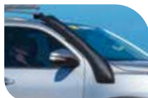
FORTUNER - 011SAT0187M (WEDGETAIL AIR RAM SHOWN)*