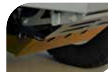
Hilux 05-11+ Front Underbody Guard*