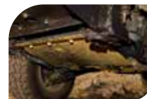
200 SERIES Front Underbody Guard*