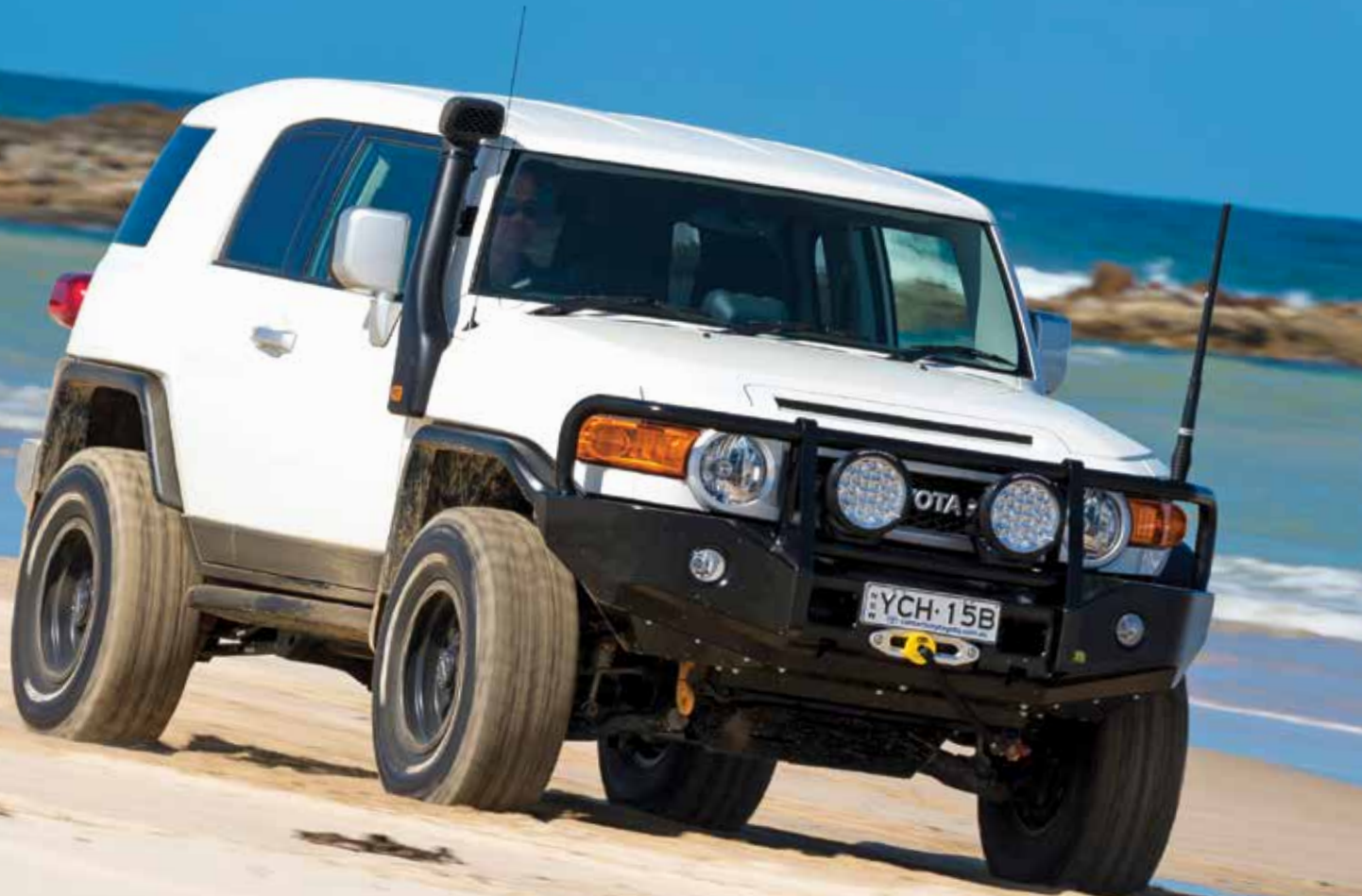
Outback Steel Bull Bar 070SB13L85A SUITS PETROL MODELS