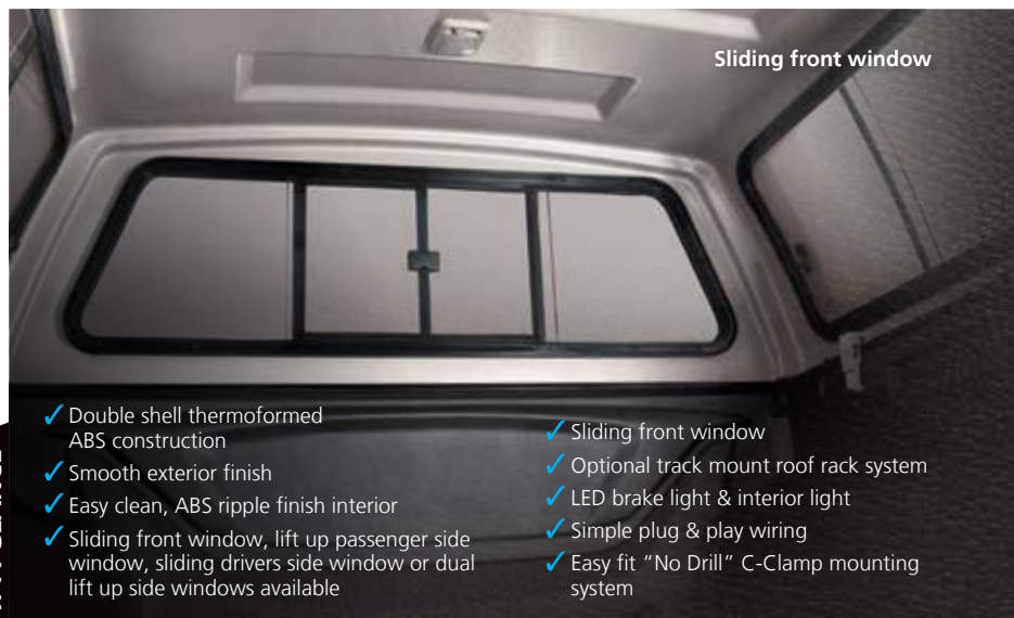
Sliding front window