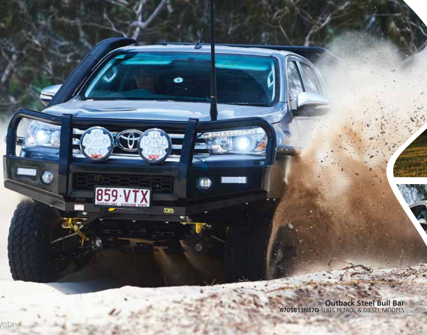
Outback Steel Bull Bar 070SB13N87D SUITS PETROL & DIESEL MODELS