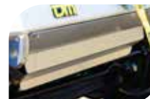
70 Series Front Underbody Guard*