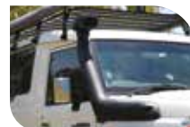
70 SERIES - 011SAT0169G (Snorkel body) 70 SERIES - 011AIR0169G (Air ram)