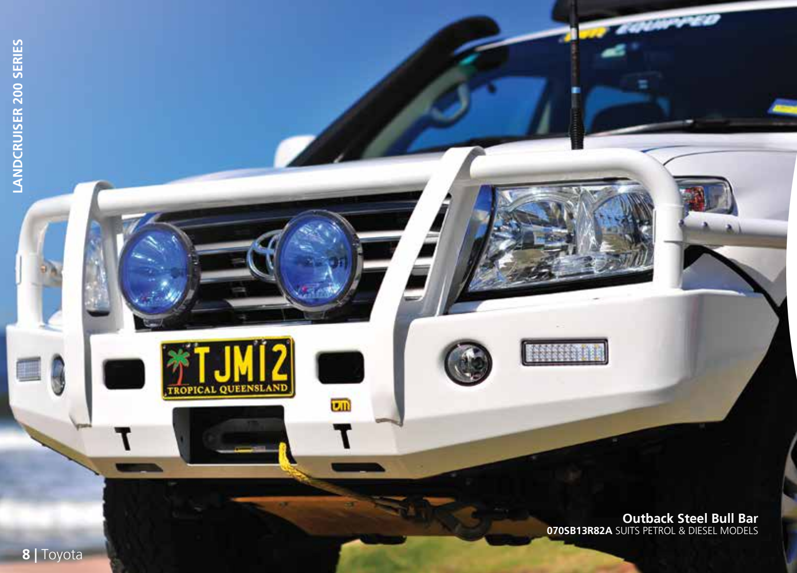
Outback Steel Bull Bar 070SB13R82A SUITS PETROL & DIESEL MODELS