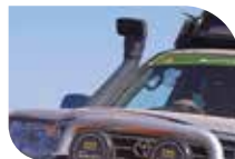
100 SERIES - 011SAT0580R