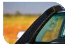
150 SERIES - 011SAT0188L