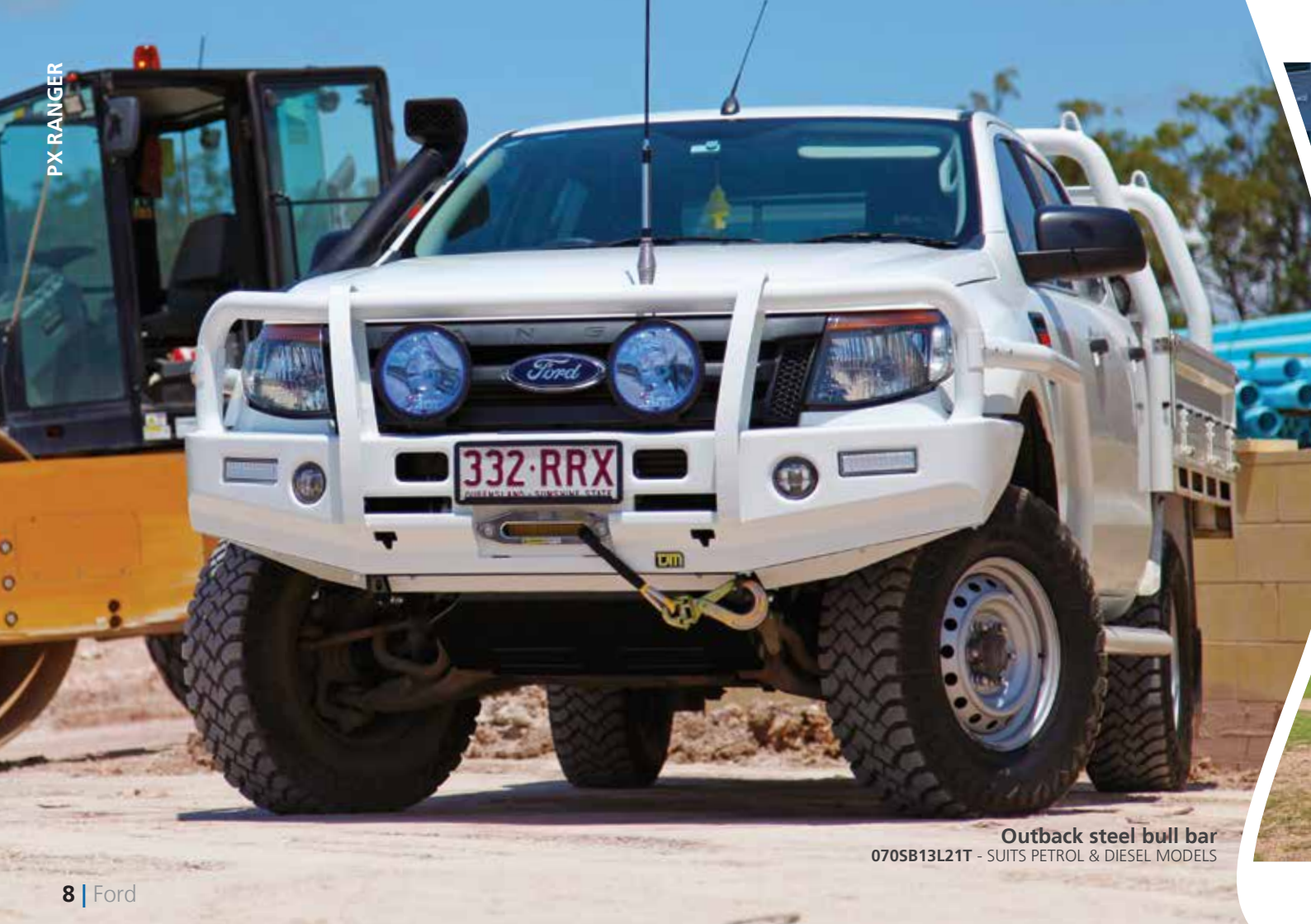
Outback steel bull bar 070SB13L21T - SUITS PETROL & DIESEL MODELS