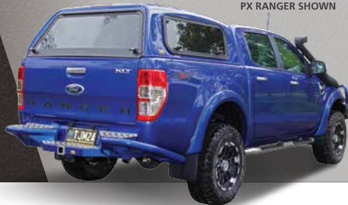
PX RANGER SHOWN

A smooth, high gloss, durable finish in gel coat white, coupled with optimum UV protection ensures a maintenance free exterior.