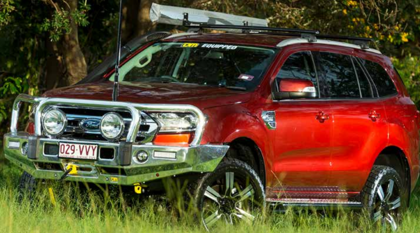
Signature alloy bull bar 070AP15N20A - SUITS EVEREST & PXII RANGER