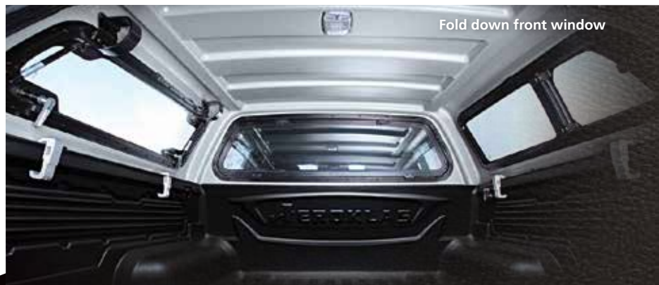
Fold down front window

This provides a water tight, extremely strong mounting architecture for enduring performance.