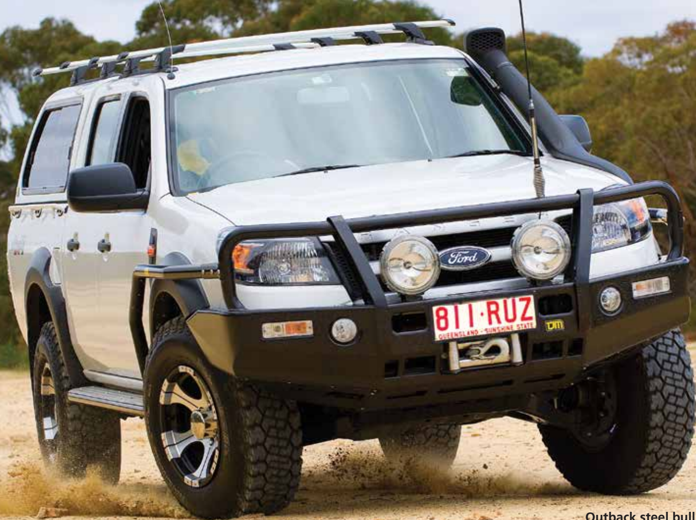
Outback steel bull bar 070SB13N21S - SUITS PETROL & DIESEL MODELS