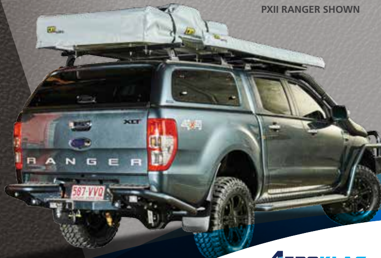
PXII RANGER SHOWN